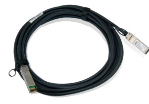
Figure 1. Cable (non-binding illustration)