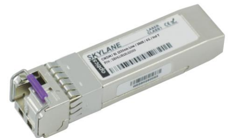
Figure 1. SFP+ Single Fibre (non-binding illustration)