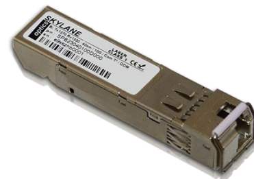
Figure 1. SFP Single Fibre (non-binding illustration)