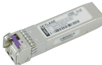
Figure 1. SFP Single Fibre (non-binding illustration)