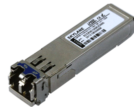
Figure 1. C-SFP Single Fibre (non-binding illustration)