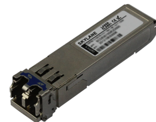
Figure 1. Compact SFP (non-binding illustration)