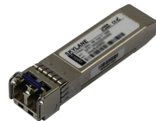
Figure 1. SFP Dual Fiber ITU CWDM (non-binding illustration)