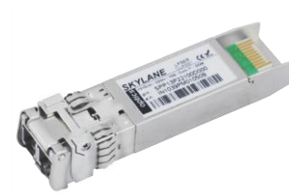
Figure 1. SFP Dual Fibre (non-binding illustration)