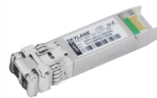
Figure 1. SFP Dual Fibre (non-binding illustration)