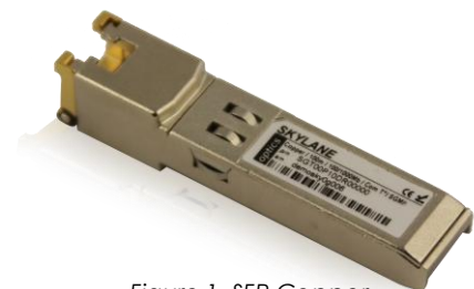
Figure 1. SFP Copper (non-binding illustration)