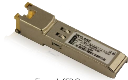
Figure 1. SFP Copper (non-binding illustration)