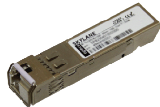
Figure 1. SFP+ Single Fiber (non-binding illustration)