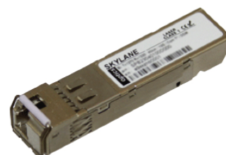
Figure 1. SFP+ Single Fibre (non-binding illustration)