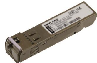
Figure 1. SFP+ Single Fibre (non-binding illustration)