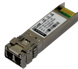
Figure 1. SFP+ Dual Fiber (non-binding illustration)