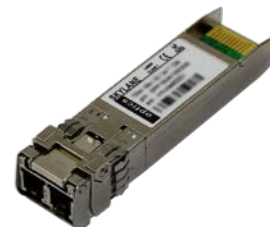
Figure 1. SFP+ Dual Fibre (non-binding illustration)