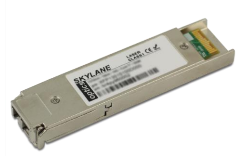
Figure 1. XFP (non-binding illustration)