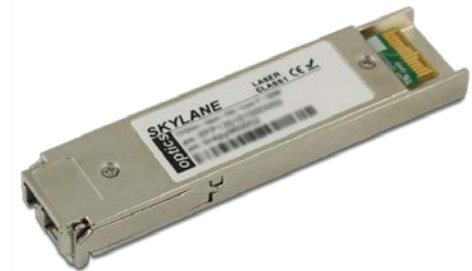
Figure 1. XFP Dual Fiber (non-binding illustration)